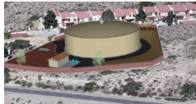
Rendering of new Jackson Reservoir