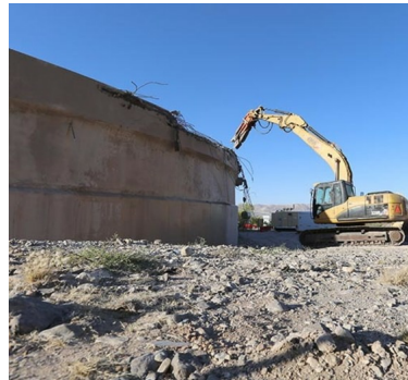
Jackson Reservoir demolition

We appreciate your patience as we embark on this major project. Customer service remains at the forefront of our mission to provide vital services to the surrounding community. Please be assured we are working as efficiently as possible to minimize impacts to nearby residents.